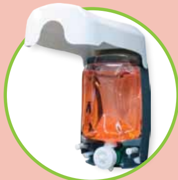
Quick Change Stay Put Cover