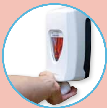
Push Cover Dispensing