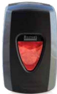
Black Dispenser HIL22281