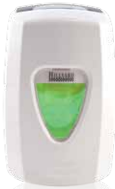
White Dispenser HIL22280